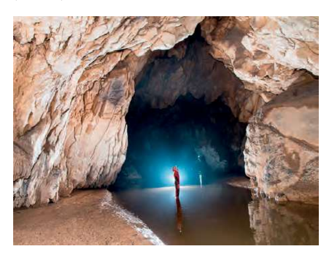
Figure 2: Main passage of Phruno Cave (Phil Bence)

The landscape with large dolines was visited from the British-Myanmar expedition team from 2012-17. The major town is located near a seasonal depression that fills up in the rainy season. This area currently contains the second longest horizontal cave of Myanmar, called Khauk Khaung (Stone Cave), which has a length of 4.9 km length. It contains a sinking river, and its monsoon overflows. Other nearby river caves include the Linwe Sink Systems with 1.9 km and 0.9 km length, which are hydrologically connected to Stone Spring Cave. Ywangan is developing community-based ecotourism within Stone Cave, and Ye Win & Wu Dwin Cave (FFI 2019).