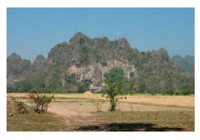
Figure 3: Tower karst of Hpa-An with the Bayin Nyi Cave entrance and monastery (Joerg Dreybrodt)

The scenic tower karst of Hpa-An, the extension of the plateau into the lowlands (Fig. 3). The limestone is already eroded into isolated karst hills. Almost every hill hosts a cave; all of them are monastery sites. The entrance areas are decorated with Buddha statues and stupas. The longest cave is Saddan Gu with 800 m length followed by several others of 400 m length. This area was selected by the British Nature Conservation NGO Fauna & Flora International (FFI) as its first karst conservation and fauna research site.