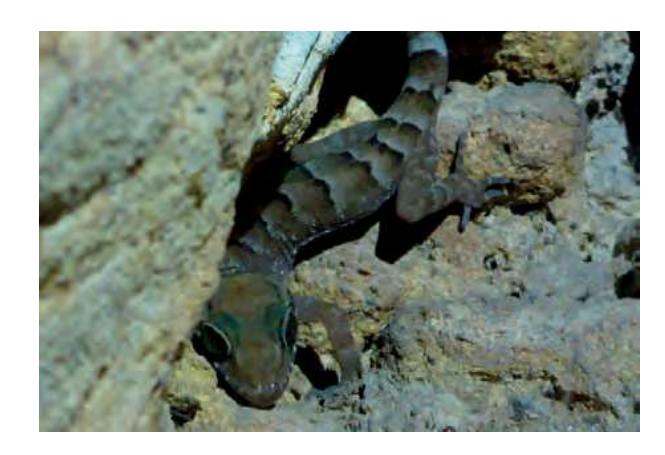
Figure 4: Cave Gecko in a cave on the Shan plateau (Urs Etter)

In total, 24 new KBA karst sites (with many of them hosting caves) are in the process of being included into the World Database of Key Biodiversity Areas of the IUCN (CEPF 2020). Hpa-An caves, Stone Cave, Parpant Caves and Phruno Cave are included.